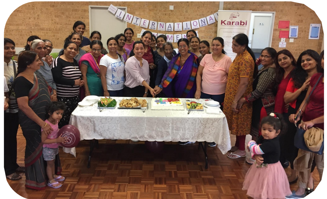
International Women's Day 2019