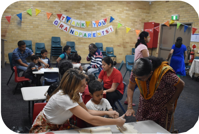
Grandparents Day 2018