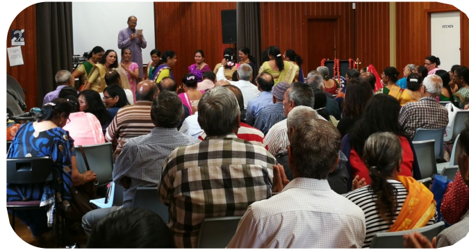
Diwali Festival 2018