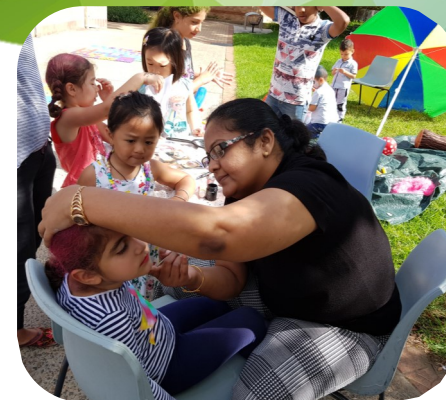
Playgroup Coordinator (Resigned from January)